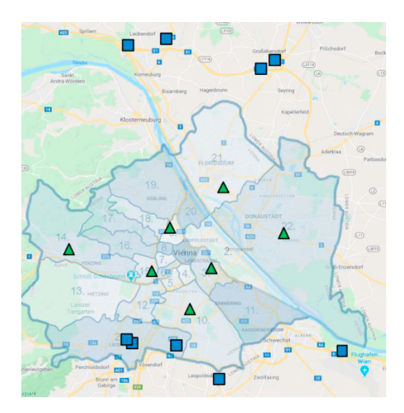
Fig. 1. Distribution centers (blue squares) and potential city-hub locations (green triangles) for Vienna.

For assessing the fleet composition, freight mileage, and fleet operation costs, we use operations research (OR) methods (Lagorio et al, 2016). For the sake of simplicity and applicability of assessment methods, it is assumed that for the appropriate level of automation, adequate infrastructure exists (e.g., for receiving parcels at night). It is also assumed that the pure technological obstacles are solvable and do not hamper the operations. The road safety impact is handled both qualitative and quantitative aspects. For the driving behavior and the interactions of delivery robots with pedestrians, there are only few studies. Therefore, they are handled in a qualitative manner. The quantitative results for the number of potential crashes are based on micro-simulation and surrogate safety assessment model (SSAM). For a detailed description of the road safety assessment methods, we refer to Weijermars et al. (2021).