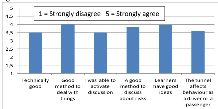
Fig. 1. Instructors' evaluations of the tunnel of choices

The instructors were asked to describe their experiences with the tunnel. Almost all instructors 78% reported positive experiences with the tunnel. The main content of instructors' comments was active participation of learners and the quality of their ideas. Critical comments were connected to difficulties to facilitate discussion.