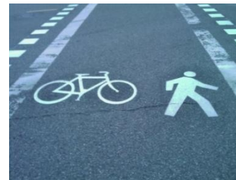
High visibility shared crosswalk.

The boulevard will have a distinctive look so that cyclists are aware of the bike boulevard and motorists are alerted that the street is a priority route for bicyclists. Signage and pavement markings such as street signs, wayfinding signs, warning signs, and sharrows will provide destination and distance information and will warn users about upcoming changes in the roadway or route as needed.