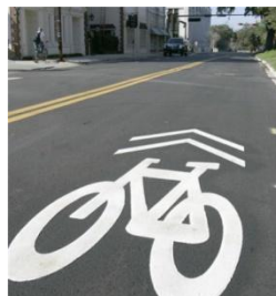
Sharrow pavement marking.