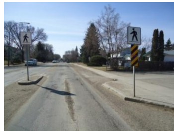
Curb extensions and median islands.