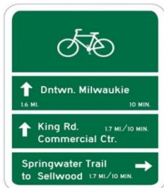
Street sign with wayfinding information.

The boulevard will have a distinctive look so that cyclists are aware of the bike boulevard and motorists are alerted that the street is a priority route for bicyclists. Signage and pavement markings such as street signs, wayfinding signs, warning signs, and sharrows will provide destination and distance information and will warn users about upcoming changes in the roadway or route as needed.